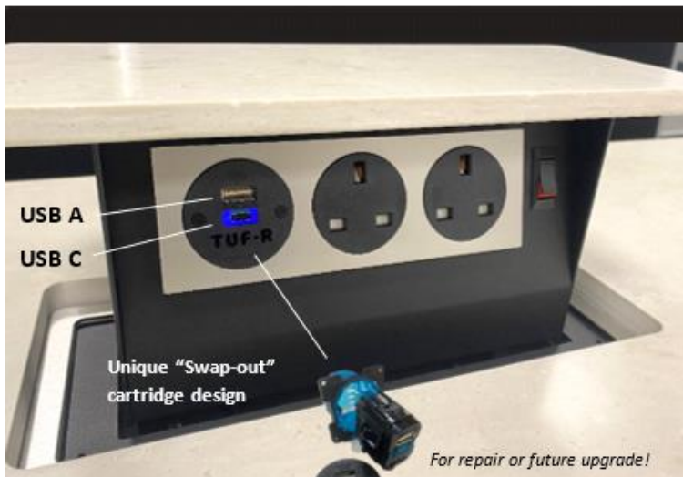
GB/UK sockets (example only)